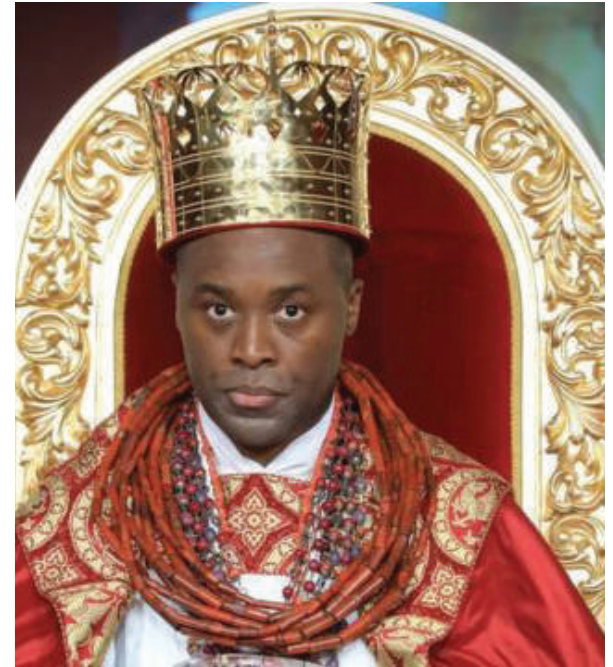
Ogiame Atuwatse III

The city key presentation is also a direct symbol of the city wish that a guest is free to come and go at will and a great honour to the recipient alike.