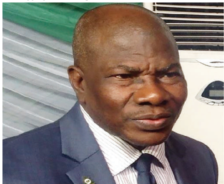
Sunday Thomas, CEO NAICOM

According to NAICOM, a web aggregators are expected to have a minimum share capital of not less than N5 million as of the date of application and shall continue to maintain the same capital base throughout the licence period, even as the web aggregator shall submit daily financial position to the commission.