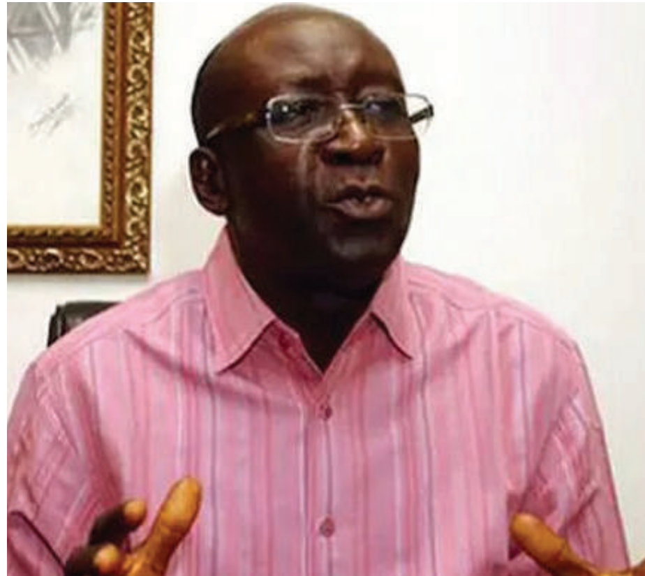
Dr. Iyorchia Ayu

"The question of saying that all we are going to give a quarter or so to the ruling party must not arise in this election.