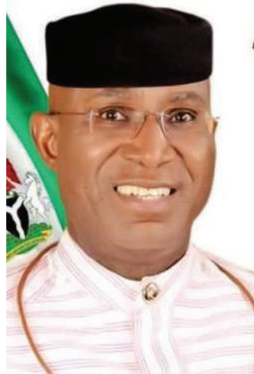
Sen. Ovie Omo-Agege

"We have performed significantly in the capital side of the budget with many outstanding accomplishments in infrastructural development. As a government we have added value to the people of Delta whether they live in the creeks or in the upland so for Omo-Agege to say that N700 billion is not accounted for, you begin to