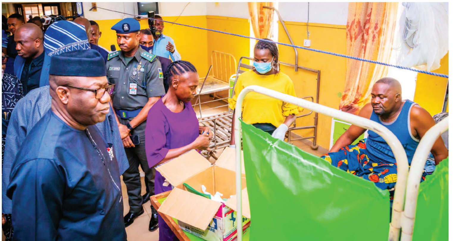
Ekiti State Governor, Dr. Kayode Fayemi; with a victim of the gunmen attack, when he visited survivors of the onslaught at St Louis Catholic Hospital, Owo, Ondo State.

The Police boss reiterated the commitment of the Force to stamping out threats to peaceful and credible elections at all levels, even as he vows to deal decisively with anyone caught engaging in political thuggery.