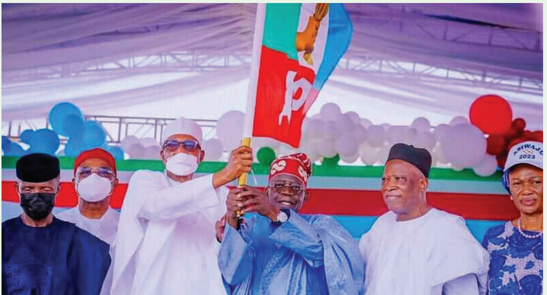
Osinbajo (left), Buhari, Tinubu, Adamu and the APC presidential torch bearer's wife, Senator Remi Tinubu after the veteran politician's victory at Eagles Square, Abuja.

Gets greetings from Osinbajo, Atiku, Amaechi, Lawan etc → 2