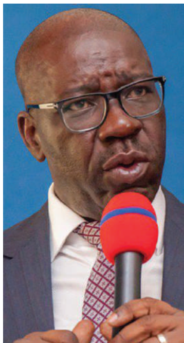
Gov. Godwin Obaseki