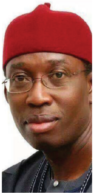
Dr. Ifeanyi Okowa

This year, the Carrington Youth Fellowship Alumni Association partnered with the Kensington Adebukunola Adebutu Foundation and Access Bank to increase the amount of fellows from 25 to 50 in addition to expanding the fellowship to Ogun and Oyo states. To date, CYFI has graduated 174 outstanding young Nigerians who share a common goal of positively impacting Nigerian society.