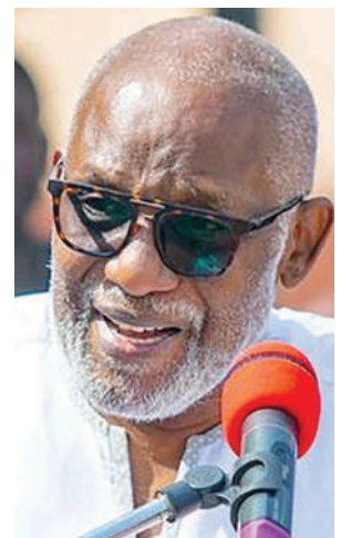
Gov. Oluwarotimi Akeredolu

said, "We will not wait for us to be captured. Nobody can capture us. We are from Ondo State, we are indomitable, we are fighters and we will fight to the last."