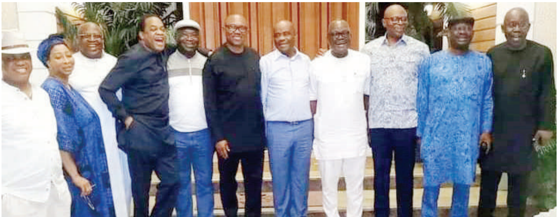
Labour Party Presidential Candidate Peter Obi (middle) and some current, former governors and others when he met them at the residence of Rivers State Governor Nyesom Wike (5th right) in Port Harcourt. Story on top strip.