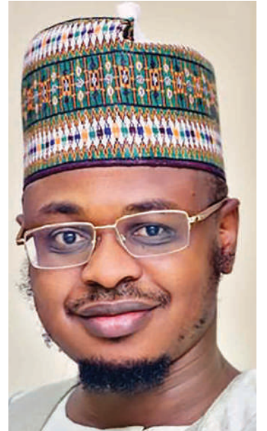
Prof. Isa Pantami

The minister warned that any institution that failed to give access would be reported to President Buhari and thereafter sanctioned, stressing that the committee, which would be supervised by the Federal Ministry of Communications and Digital Economy, as well as other relevant government institutions will sanitise the