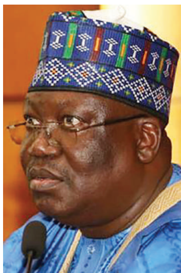
Senate President, Ahmad Lawan

Consequently, the Senate is demanding a refund of $200