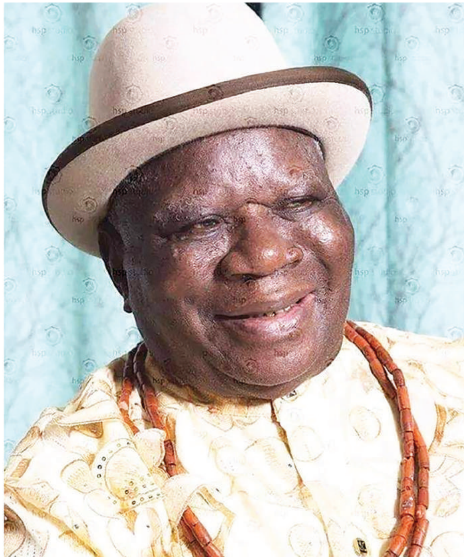
Chief Edwin Kiagbodo Clark

"It is essential to underline that the Southern, and Middle Belt Leaders' Forum, applauded the meeting of the governors, given its significant representation and the gravity of the outcome; we followed up and issued a similar statement after