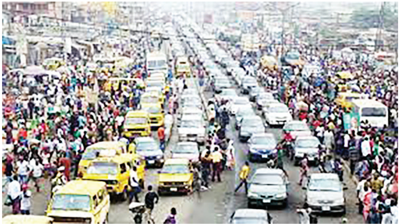
Lagos ranked second worst city in the world

The project development is expected to be completed in December 2024.