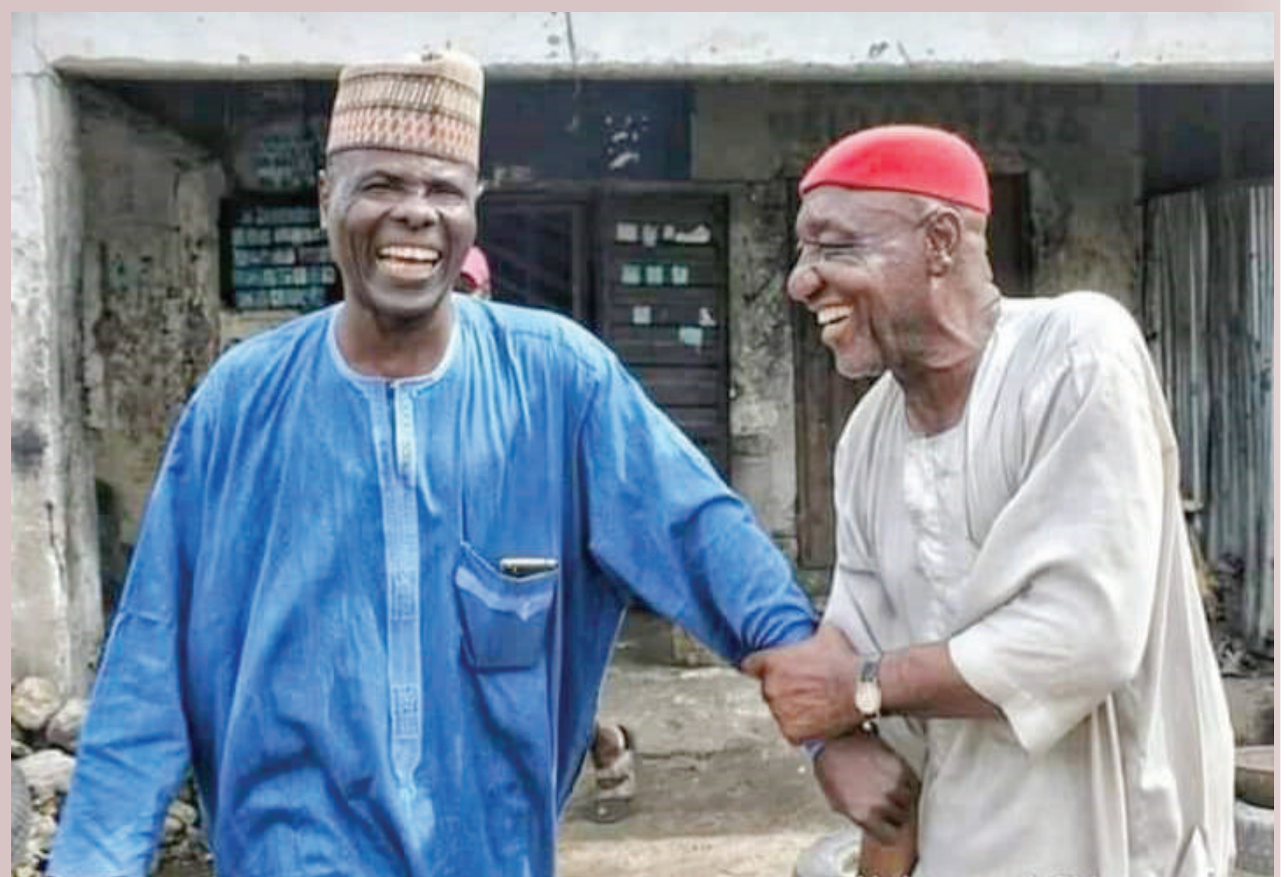
Despite politically-motivated ethnoreligious tensions, there is still unity in the streets.

■ Strikes out suit, says President's request violates constitution → 2