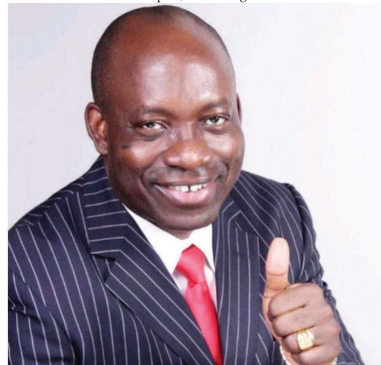
Prof. Charles Soludo