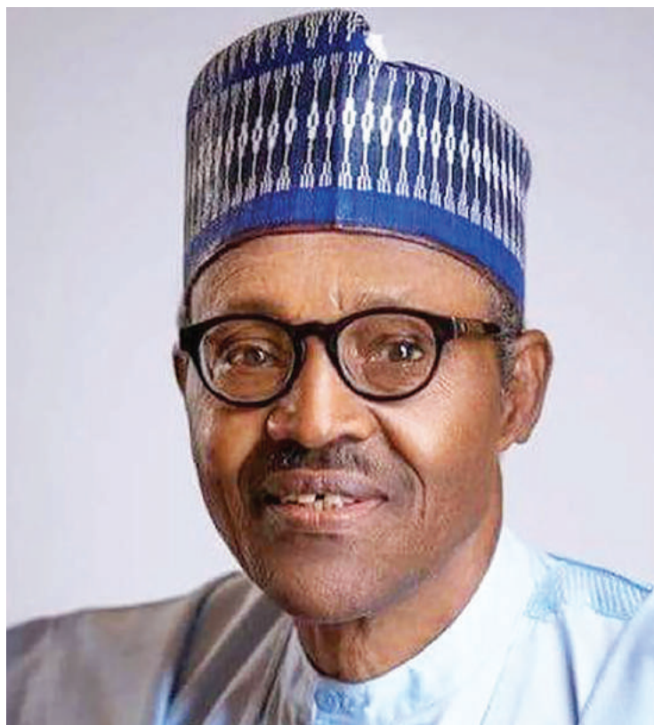
President Muhammadu Buhari

“The officials of the Buhari government have publicly