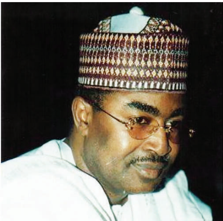
Mohamed Buba Marwa

Chairman/Chief Executive of NDLEA, Brig Gen Mohamed Buba Marwa (Rtd) while commending the officers and men of the MMIA, Ondo, Akwa Ibom and Kaduna Commands of the Agency for the seizures and arrests in the past week, charged them and their compatriots across the country to remain steadfast and vigilant in their areas of responsibility.