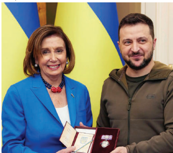
Pelosi and Zelesky

shared a video on Sunday of their meeting in Kyiv, and thanked the US for its powerful support of Ukraine against Russian