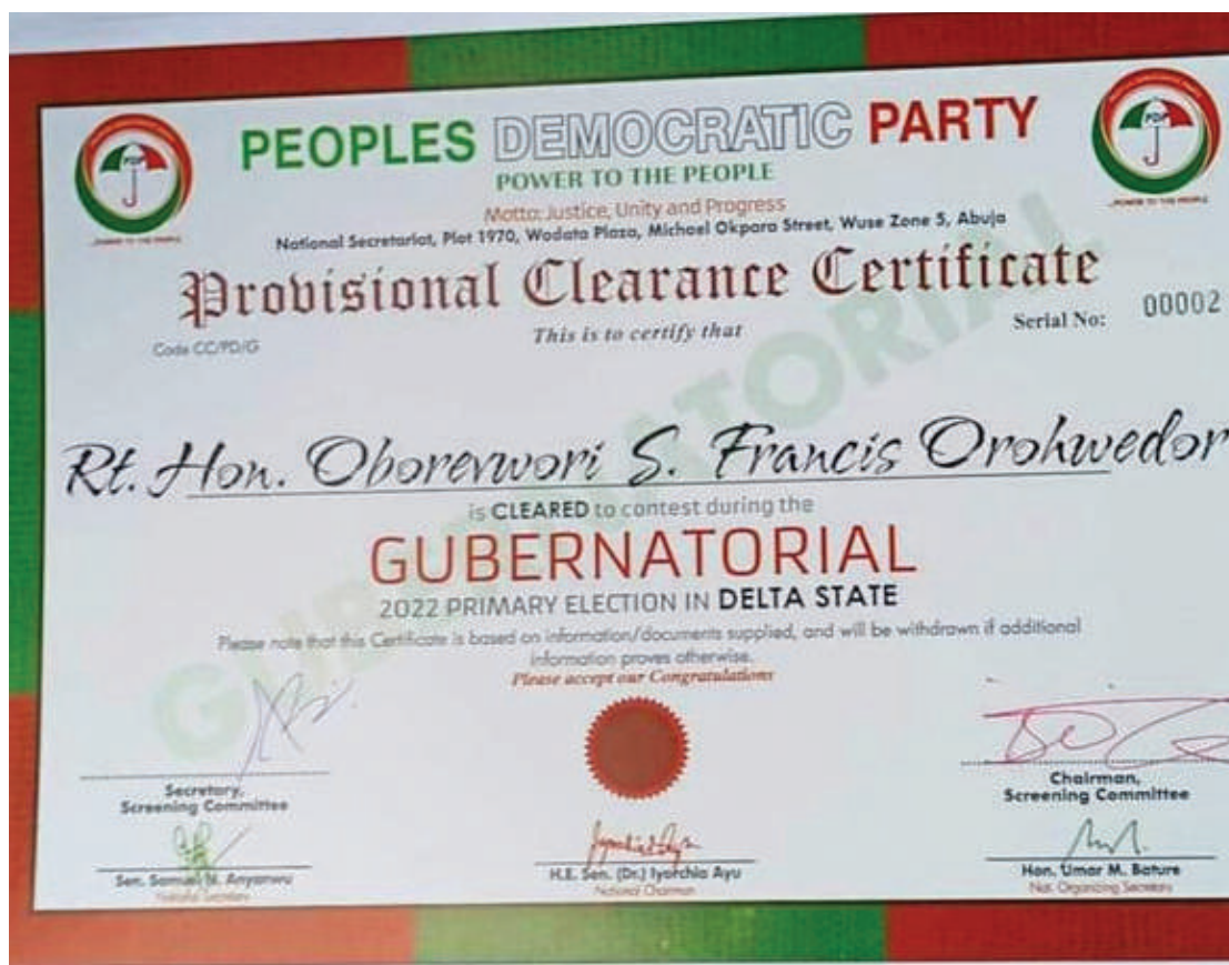
Oborevwo's clearance certificate

Delta State House of Assembly speaker, Rt Hon Sheriff Oborevwo, is deeply enmeshed in an alleged certificate scandal. Documents show dislocated certificates bearing multiple names from primary school through universities.