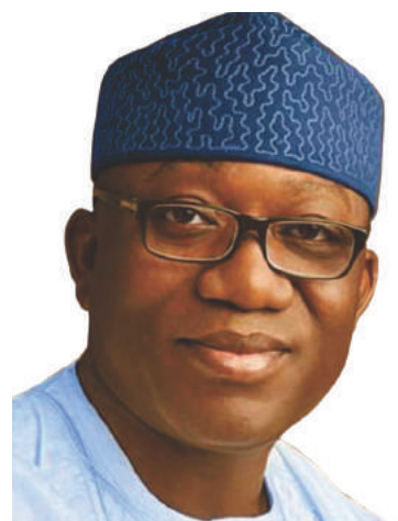
Dr. Kayode Fayemi

Fayemi who will unfold his agenda for Nigeria has in the past two weeks crisscrossed the Southwest, meeting with traditional rulers and key political actors in the region.