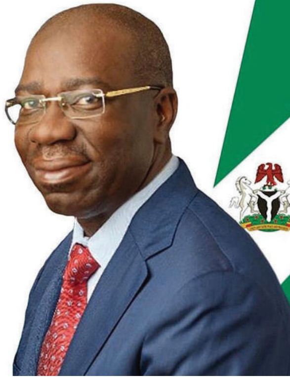
Gov Godwin Obaseki