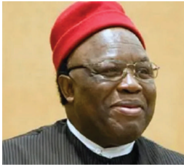
Ohanaeze President-General, George Obiozor

"I had thought they would think about the South-East; I thought they would support us. The amount of money being spent by these aspirants is alarming